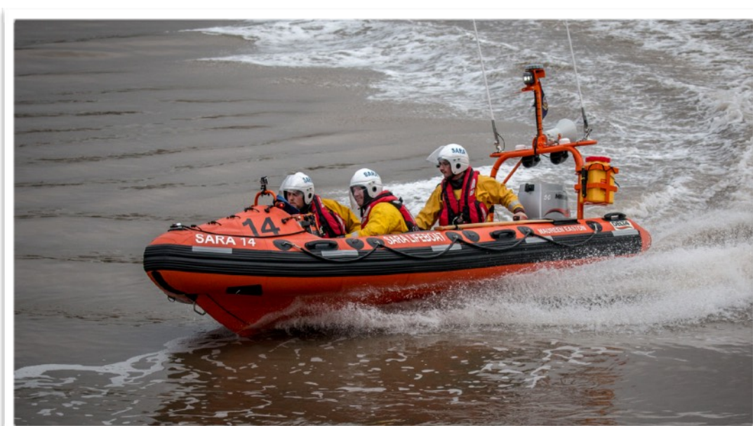
Demonstrating the new Lifeboat on the River Usk