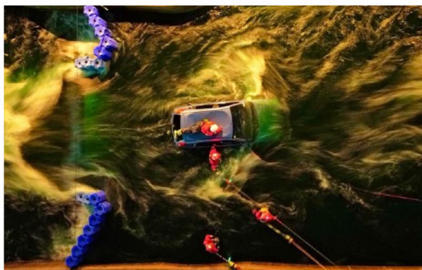
Practising Rescue from a Car, in the Dark

Then there were two repeat sessions run by Avon & Somerset Police, set up as a series of flood rescue scenarios. Flood teams made up of members from lots of different agencies had to work together, to access and rescue people from houses and flooded cars, with casualties in them and sitting on the roofs of both.