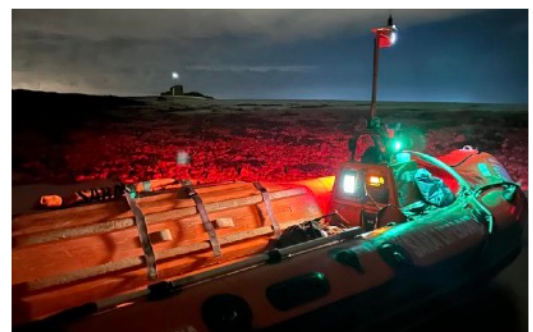
SARA Lifeboat 3 at Chapel Rock, just off Beachley

Please don't forget to tick the 'Gift Aid' box!