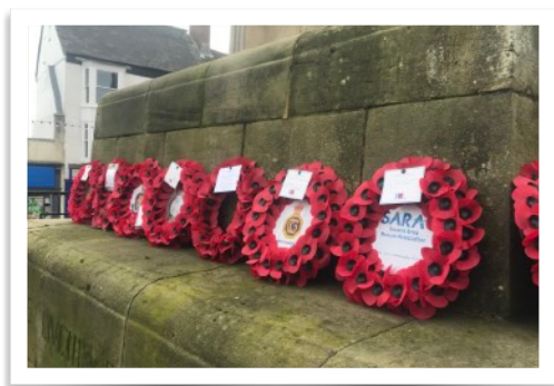
Chepstow, Remembrance Sunday

We have also been supported by a number of local councils for which we are really grateful. West Dean, Newent, Cinderford, Tidenham and Newnham Councils, thank you for your support.